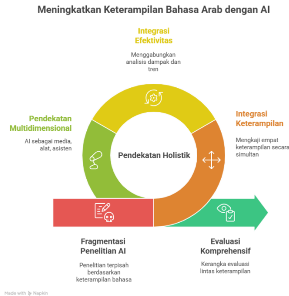
Figure 3. Literature Review

The results of the research synthesis show that publications related to the use of Artificial Intelligence (AI) in Arabic language learning have increased significantly in the last two decades. Based on the results of keyword searches on the Scopus database, the number of publications has increased gradually since 2006 and experienced a very clear spike in the period 2023 to 2025. The peak in the number of publications is recorded in 2025 with the highest number of articles compared to previous years. This pattern shows that the topic of AI in Arabic learning is a relatively new but rapidly evolving field of research. This temporal distribution reflects the increasing academic attention to the integration of intelligent technology in language education. In addition, the increase in publications also goes hand in hand with advances in Generative AI and Natural Language Processing technology which are increasingly accessible. Thus, the publication data shows a consistent and sustainable growth trend in AI and Arabic studies.